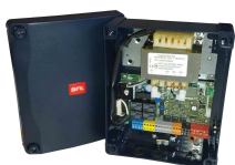
THALIA LCD Control Panel