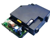
SL BAT2 Battery Kit